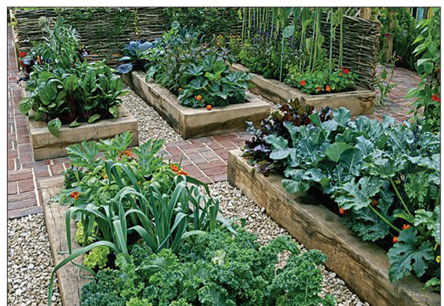
Example of a no-dig gardening method