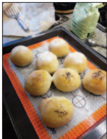
Rolls fresh from the oven

The Club has been meeting with great success since December 2015 and has gone from strength to strength. We get together one Saturday a month from late morning for a couple of hours.