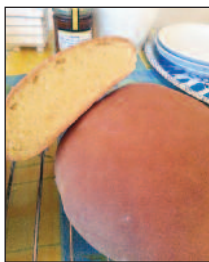
Moroccan semolina loaves