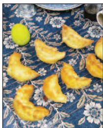
Argentinian yeasted empanadas

The Weekend Bread Club has a full programme coming up for 2017 which includes meet ups and practical hands on sessions at Members' homes as well as planned visits to a variety of artisan bakeries and mills (wind as well as water). If you'd like to know more do get in touch.