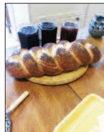
Challah ready to eat