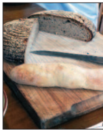
Baguette and sourdough

The Club has been meeting with great success since December 2015 and has gone from strength to strength. We get together one Saturday a month from late morning for a couple of hours.