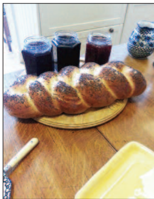
Challah - fresh out of the oven

We're planning on making traditional farmhouse loaves, pizza and Turkish pide, yeast empanadas and calzones as well as examining gluten free baking. We'll be looking at