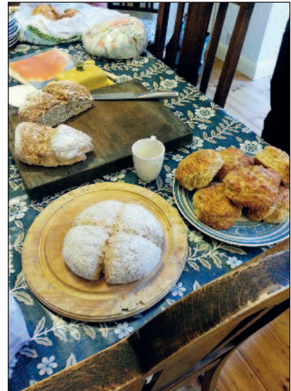
Cheese scones and soda bread

To date we've been busy making: scones, soda bread, bread rolls, challah, hot cross buns, fougasse, Chinese steamed buns, Japanese buns as well as sourdough. If you have breadmaking experience and might be interested in joining this lively and friendly Weekend Bread Club we have room for two new Members.